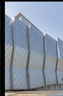
ALTEX Materials : Aluminum Composite Size : thickness 4 mm (Aluminum 1 mm) Feature : High quality ACP with PVDF coating technology reflecting your innovative facade