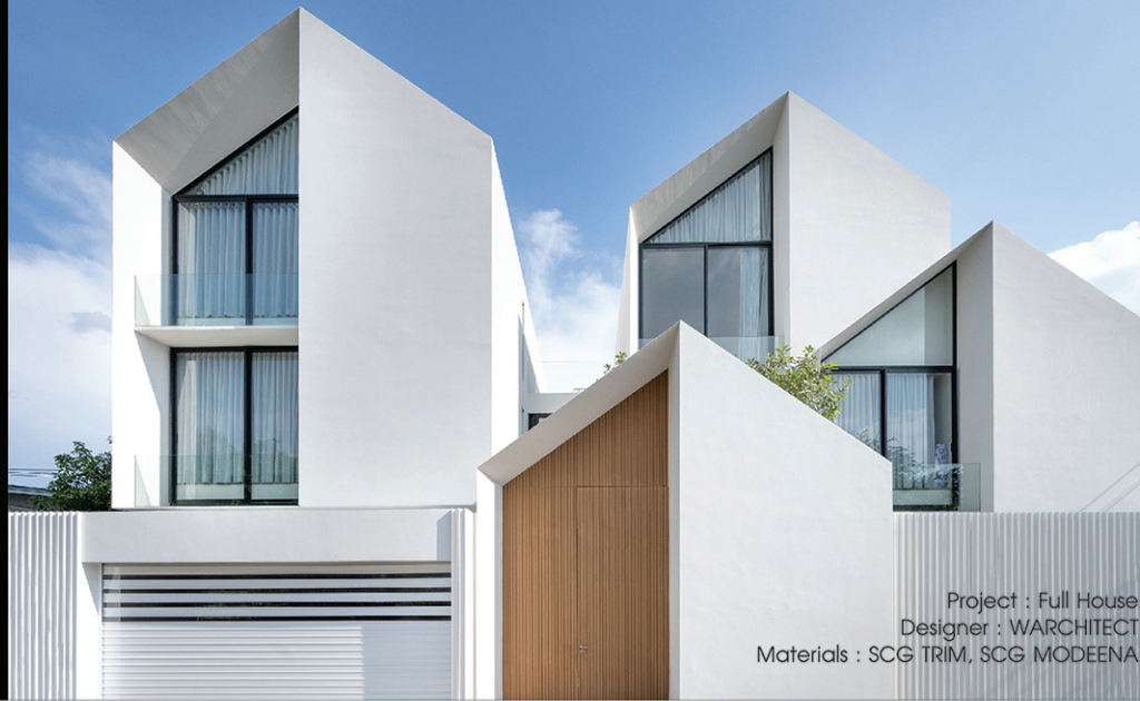
Project : Full House Designer : WARCHITECT Materials : SCG TRIM, SCG MODEENA

Facade is an identity of building. DECAAR Facade Solution willing to give advice selecting different decorative materials, recognize the importance of detailed installation as well.