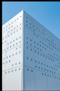
SCG FRETWORK Materials : Fiber Cement Hi-Density or Aluminum Composite/Sheet Size : from 1x1 m to 1.24x2.44 m Feature : A wide variety of fretwork patterns or can be custom-made