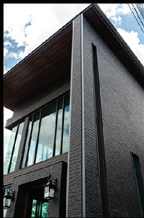
KMEW Materials : Fiber Cement Size : 45.5x303x2.1/1.8/1.6/1.4 cm Feature : Natural looks with high standard system and self cleaning technology