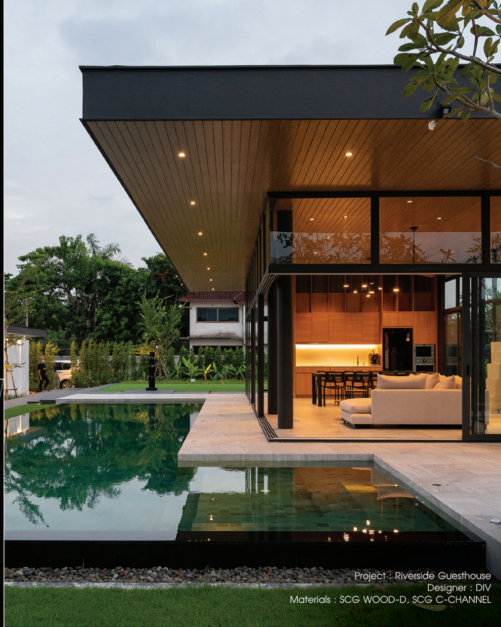
Project : Riverside Guesthouse Designer : DIV Materials : SCG WOOD-D, SCG C-CHANNEL

Creating outdoor living space matching to the lifestyle, connecting with nature. DECAAR Outdoor Living Solution provides alternative natural materials and prefab products with comprehensive design and installation to serve one stop service.