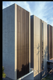
SCG MODEENA Materials : Fiber Cement Size : 30x300x2.5/2.3/1.8 cm Feature : Striking organize pattern both color and un-color panel