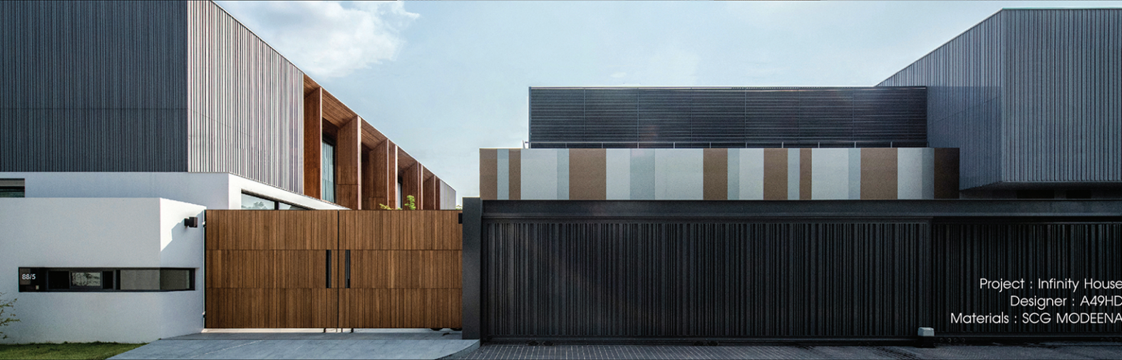
Project : Infinity House Designer : A49HD Materials : SCG MODEENA