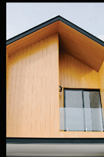
SCG WOOD-D Materials : Fiber Cement - Digital Printing Size : 20x300x1.2 cm Feature : Digital printing technology creating a genuinely realistic wooden pattern and color