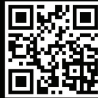
Outdoor Living Solution