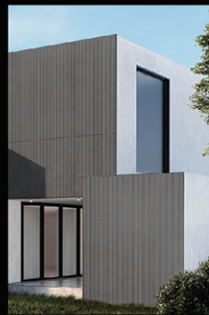
SCG MODISH Materials : Fiber Cement Series : Modish-V and Modish-U Size : 24.7x300x3.1 and 24.5x300x3.8 cm Feature : Capturing Refined Texture with new decorative panel pattern