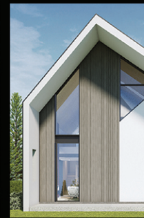
SCG COATE Materials : Fiber Cement Size : 20x300x1.2 cm Feature : Wood simplicity with color coating technology that make wood plank more magnificent than before